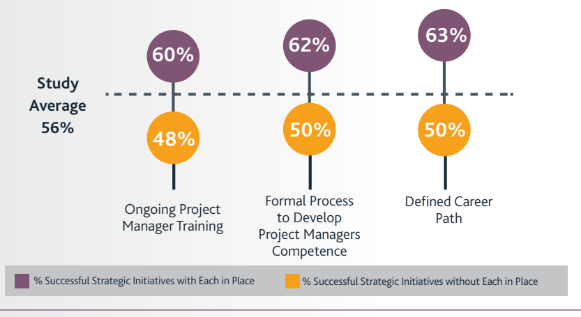
Figure 8: Talent Management Leads to Success

PMI's 2014 Pulse of the Profession® survey reveals that most organizations need to pay attention to the training and development of project management talent. Less than one half of organizations report having a formal process for developing project managers. And organizations that have a defined career path, develop project management competency, and have ongoing training for staff on the use of project management tools and techniques are significantly more successful with their strategic initiatives than organizations that do not (see Figure 8 ).<sup>16</sup>