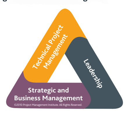
Figure 7: The Talent Triangle