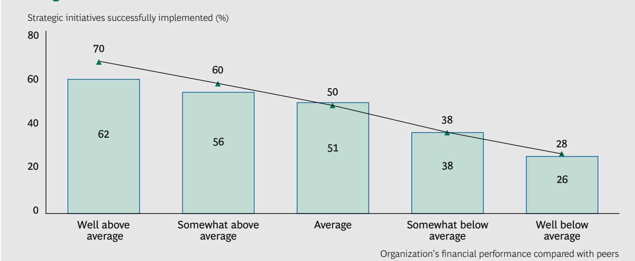
EXHIBIT 1 | There Is a Clear Correlation Between a Company's Ability to Successfully Implement Strategic Initiatives and Its Financial Performance

Sources: Economist Intelligence Unit's March 2013 global survey of 587 senior executives for the July 2013 report, Why Good Strategies Fail: Lessons for the C-Suite; BCG analysis of raw survey data provided by the EIU.